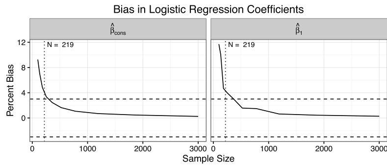
Figure 1. This figure shows the percent bias for the intercept and coefficient for x_1 . The rule of thumb requiring ten events per explanatory variable suggests a minimum sample size of about 219. For samples larger than about 250, the bias falls below three percent and it nearly disappears as the sample size approach 3,000.